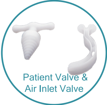
Patient Valve & Air Inlet Valve