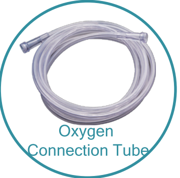
Oxygen Connection Tube